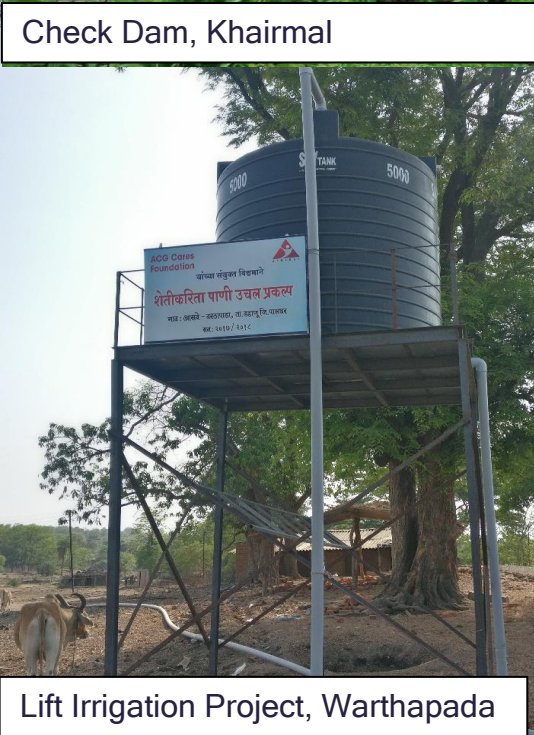
Lift Irrigation Project, Warthapada