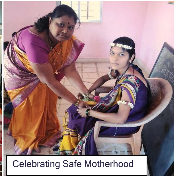
Celebrating Safe Motherhood