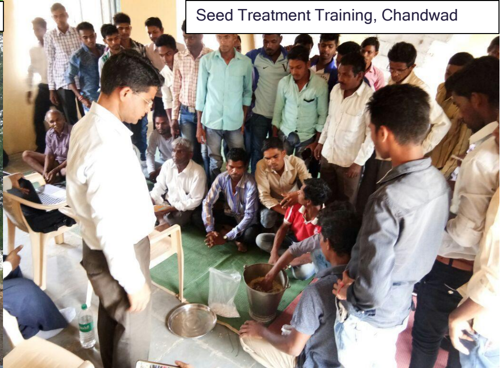
Seed Treatment Training, Chandwad