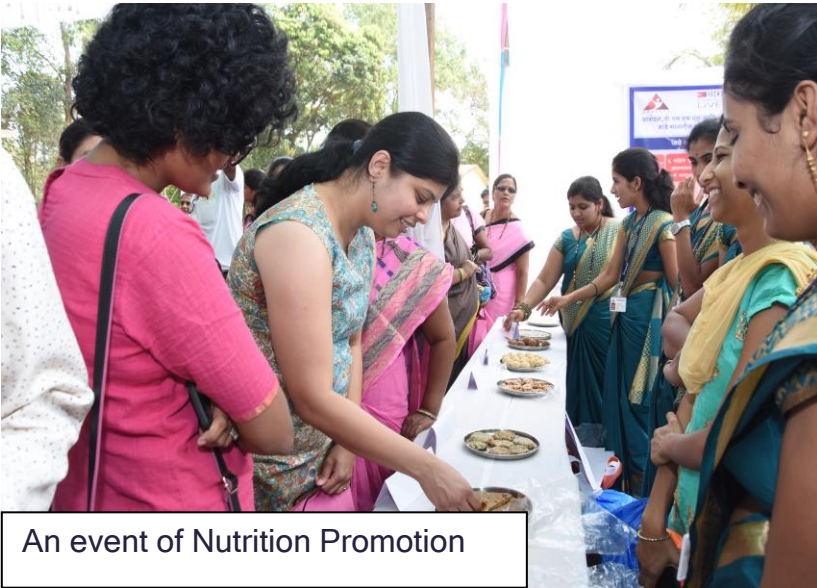
An event of Nutrition Promotion