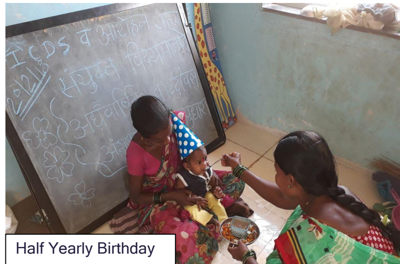
Half Yearly Birthday