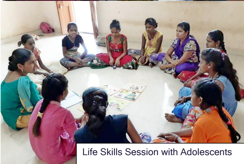
Life Skills Session with Adolescents