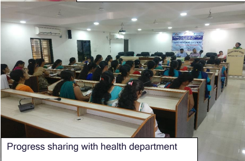
Progress sharing with health department