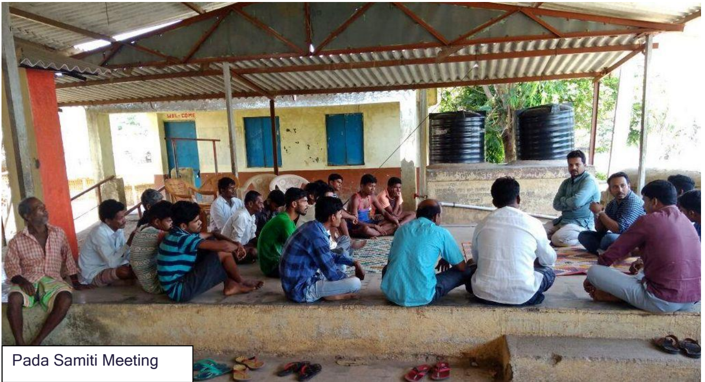
Pada Samiti Meeting