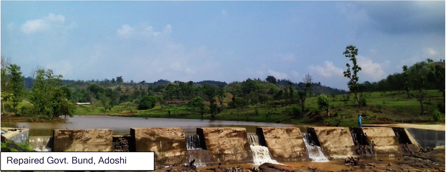
Repaired Govt. Bund, Adoshi